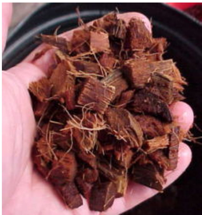
Hydrated Medium Coconut Husk Chips

Two medium components did defy logic and have the capacity to hold large amounts of air and water simultaneously. The first is New Zealand sphagnum moss used alone. NZ sphagnum will simultaneously hold more water and more air than almost any other potting medium commonly available if kept loosely packed, but therein is one problem: overpack it or allow it to pack itself overtime and it holds way too much water and too little air. NZ moss does have some drawbacks: it is also hard to stabilize a plant in its pot with a loose pack of moss, it is hard to rewet if allowed to completely dry out, and does break down fairly rapidly if kept moist, so for some folks its a wonder medium, for most it's not very practical.