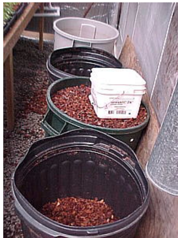
Washing Coconut Husk Chips

Coconut husk can be somewhat firmly packed in the pots, but not tremendously so, as it has a springy substance, and will change slightly in size as it loses water and then is rehydrated. It hydrates very rapidly, even from the completely dry state, and essentially instantly from the partially hydrated state it would be in your pot when you water it. It contains the water within itself like a sponge: if you squeeze a piece that is even partially hydrated, water will come out of the cut fiber end even when the outside of the husk appears dry. The exterior of the husk chips does dry very rapidly when exposed to air flow, so the tops of the pots appear to dry out very quickly, but just 1/2 inch further down their can still be a considerable amount of moisture. This takes a little getting used to in judging when to water, but has the benefits of discouraging fungus gnats (the larvae tend to live in the top 1/2 inch of the medium and prefer very moist conditions) and lessening the chance of rot starting in the lower leaf fans, especially if they are potted slightly lower than they should be.