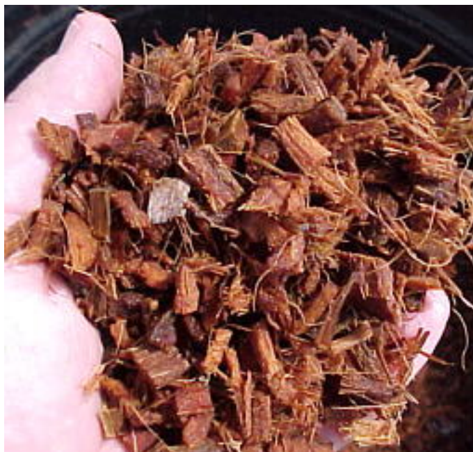
Hydrated Small Coconut Husk Chips