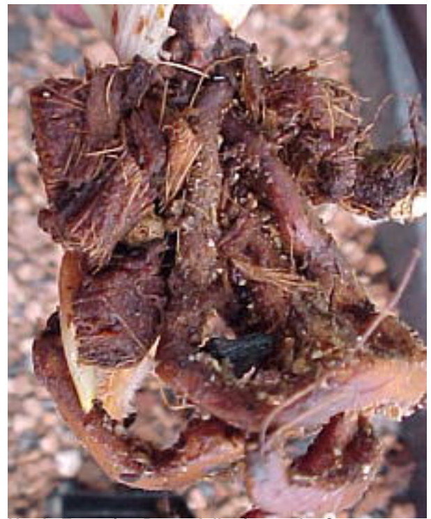
Newly Emerging Roots Adhering to the Coconut Husk Chips Just a Few Weeks After Repotting

One of the most encouraging signs that the plants like the coconut husk chips is that when we unpot them, all of the new roots are attaching themselves firmly to the cut fiber end of the husk chunks, as if they are seeking out their personal water and nutrient reservoirs. While we would find roots attached to bark chunks also, it occurred at no where near the rate it does with the husk chunks.