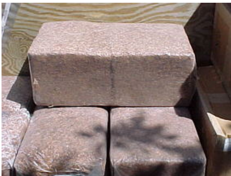
Compressed Bales of Coconut Husk Chips

Like many Paphiopedilum and Phragmipedium growers, we have depended on bark based potting mixes for 20 years. We used small bark, extra coarse horticultural perlite (despite the name, it's pretty small), and chopped New Zealand Sphagnum moss for smaller pots and medium bark, #4 spongerock, and chopped New Zealand sphagnum for larger pots. In more recent years we'd added either #2 or #4 charcoal, depending on pot size. While results have generally been good, there have been a number of problems to deal with. Sequoia brand bark (the only brand we found suitable for Paphs) supply has had some interruptions, and a few years ago the quality was very low, basically being pre broken down before you received it. This spring (2000), after an Executive order setting aside the forest they timbered, Sequoia announced it was ending all orchid bark production mid summer. The #4 sponge rock is only occasionally produced by the manufacturer, so when it became available you would have to scramble to buy as many bags as possible,